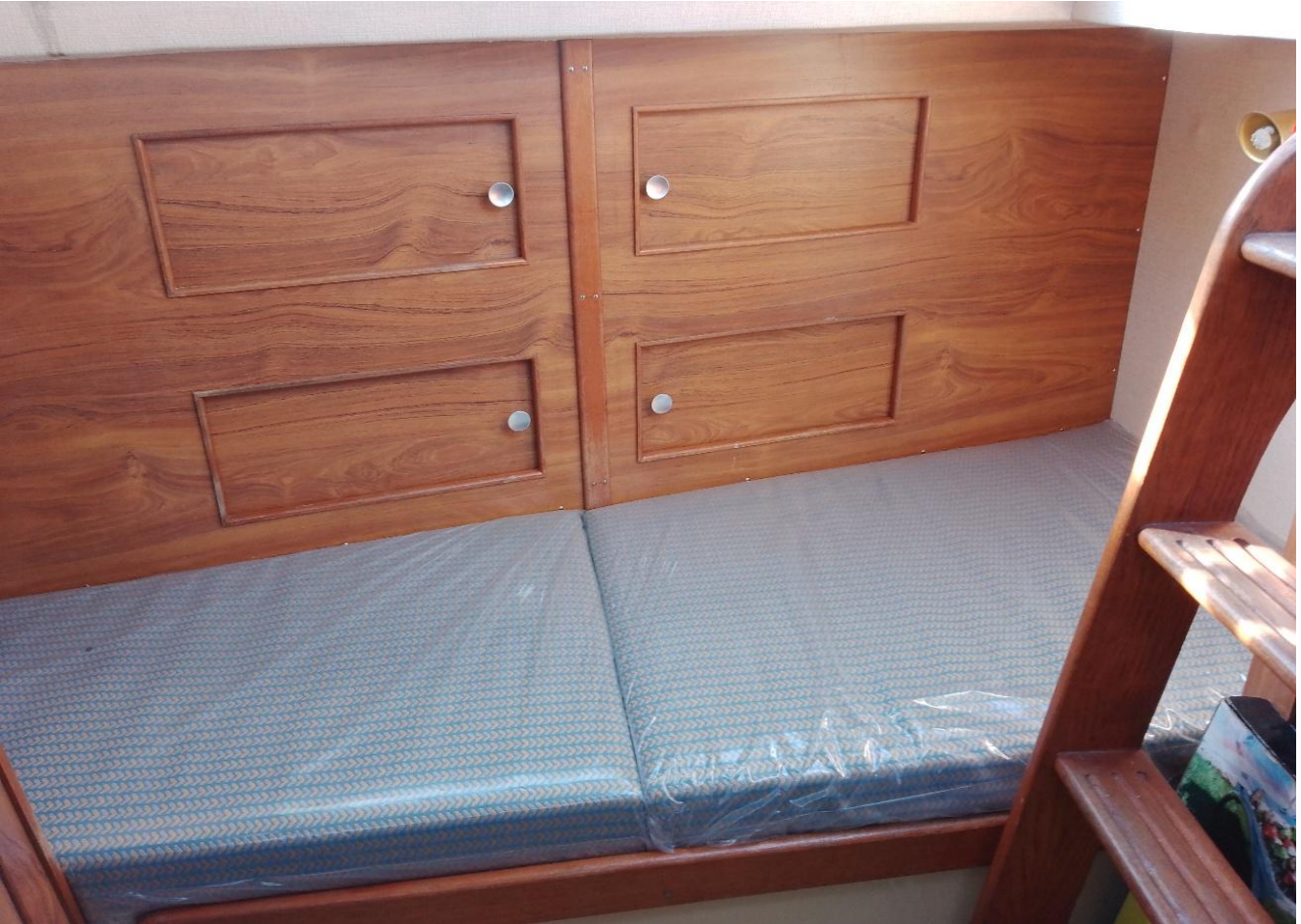
Aft cabin berth

Baltic Lifebouy, Bracket and light set 2 X Deck running safety lines 2 X cockpit harness eyes 2 X Fire extinguishers - new 2024 1 X Fire Blanket Flare Distress Pack - (out of date) Emergency tiller CO2 Carbon Monoxide Alarm